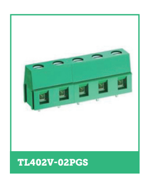
PCB Plug & Socket Terminal Blocks - Females