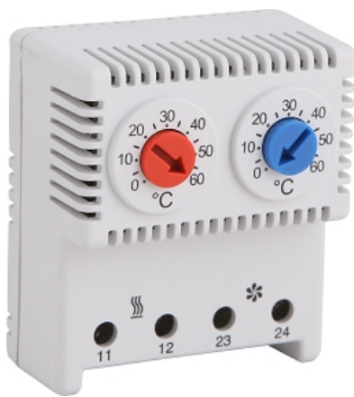
DETVHT Thermostat Wiring Diagram